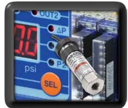
MEASUREMENT & TEST

Pearse-Bertram has developed the widest range of instrumentation, valves, fittings and measurement products available for the precise control of virtually any fluid or gas. You get the gamut of process controls and instrumentation, whether for flow, pressure, vacuum or temperature. Our knowledgeable sales engineers are ready to help assist you with all of your precision process control requirements.