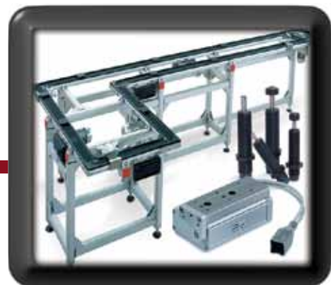
MOTION CONTROL PRODUCTS