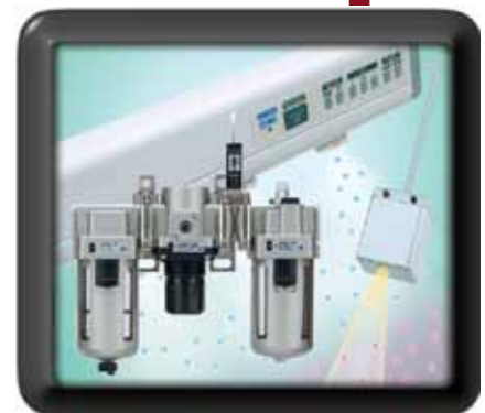
AIR & GAS PREPARATION

We have extensive experience in applying our products and systems in a variety of process industries, including semi-conductor, analytical, food & beverage, paper converting, chemical and petrochemical, alternative energy, power generation, waste-water and many more.