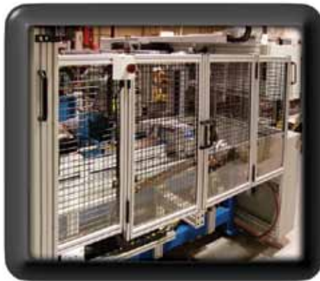
MACHINE GUARDING & SAFETY

The Engineered Products Group can integrate all of the products we sell into complete control systems and assemblies. From product customization and integration to high volume contract assembly services, you get first-in-class products with first-in-class service and expert support for all of your industrial automation and motion control needs.